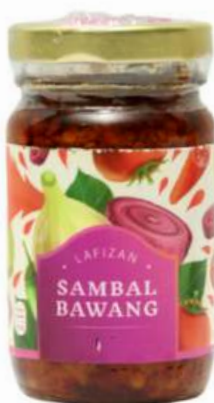
Chilli Sauce Onion