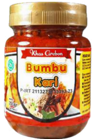
Indonesian Curry spice mix