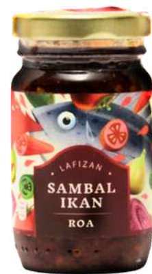
Chilli Sauce with Roa Fish