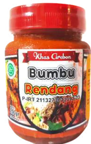
Indonesian Rendang spice mix