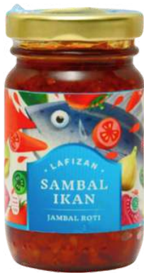
Chilli Sauce with Jambal Roti Fish

Here's a snapshot of Lafizan Sambal Ikan (Chilli Sauce with Fish)