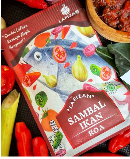
Chilli Sauce with Roa Fish