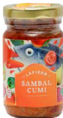
Chilli Sauce with Squid