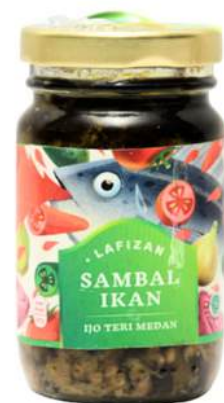
Green Chilli Sauce with Anchovies