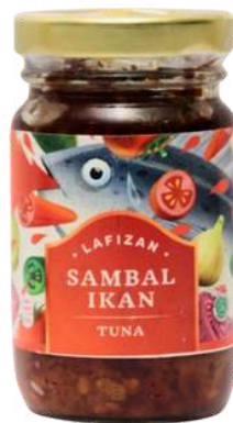
Chilli Sauce with Tuna Fish