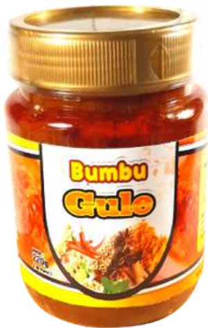
Indonesian Gule spice mix

Here's a snapshot of Lafizan Seasoning Indonesian Cuisine