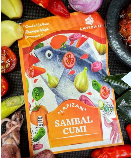
Chilli Sauce with Squid