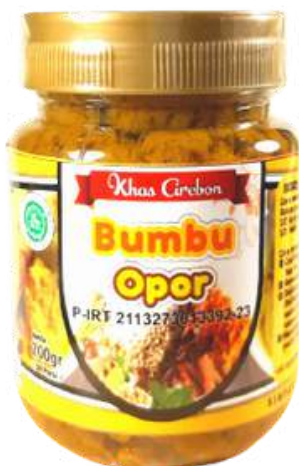
Indonesian Opor spice mix