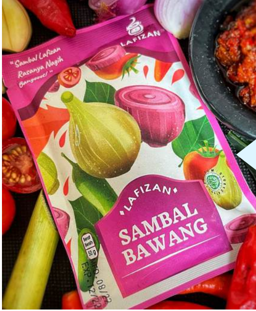
Chilli Sauce Onion

Here's a snapshot of Lafizan Chilli Sauce with Fish Sachet