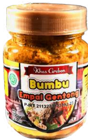
Indonesian Empal Gentong spice mix