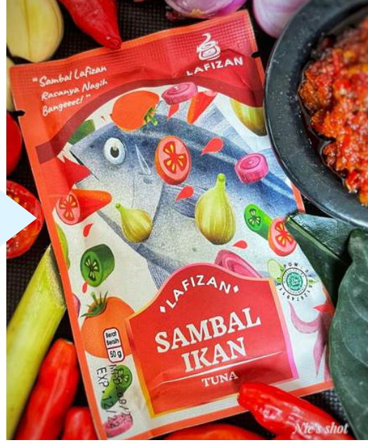
Chilli Sauce with Tuna Fish